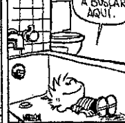
CALVIN AND HOBBS © Watterson. Dist. by Universal Press Syndicate. Reprinted with permission. All rights reserved.